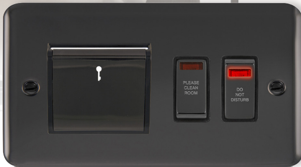
New Media™ Key Card module with 2 x GridPro® Switch Modules with Neon

A SMART, MODERN, SECURE AND ACCURATE SOLUTION