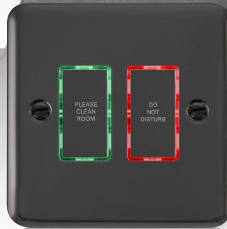
2 x GridPro® illuminated modules